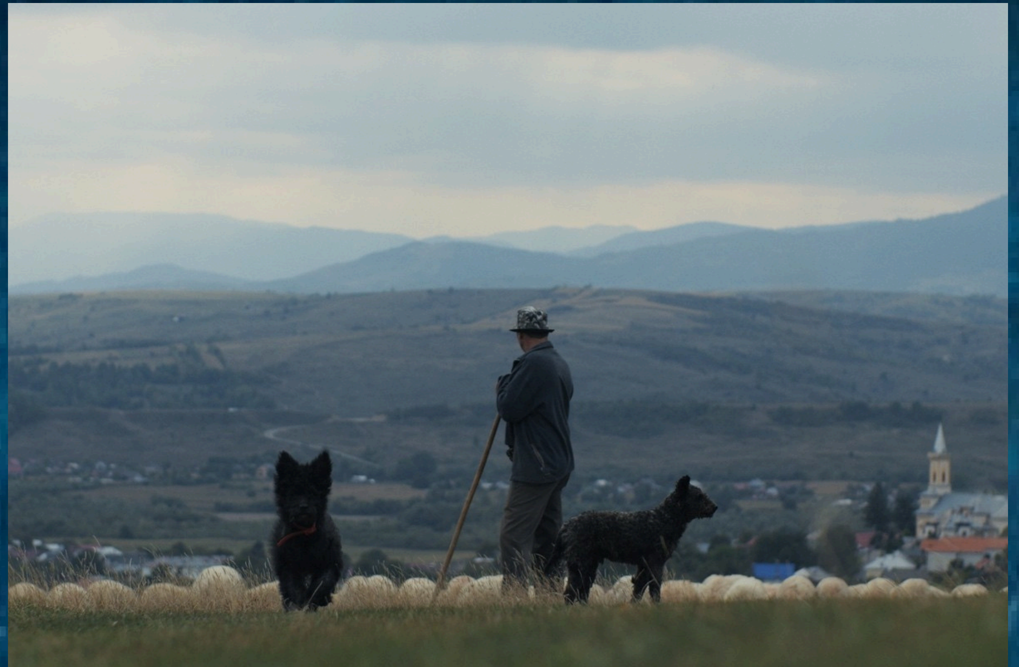
view of Pusztina